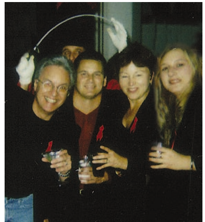
"Phoenix Four" and an unknown assailant at the "WAF Best Party 007"